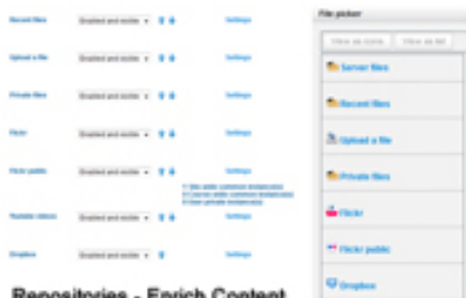
Repositories - Enrich Content from Various Sources

Repositories from Youtube, Flickr, Dropbox, Box.net, your courseware content can be easily developed.