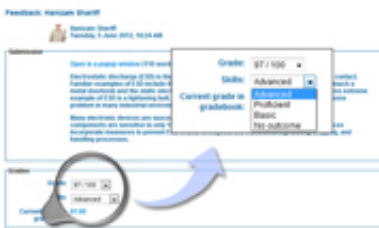
Grade and Outcomes

After the learner attend the quiz or assignment given, base on the quiz question type, some are auto-marked, some needs trainer to give grade and outcome eg. Excellent, Good, Poor.