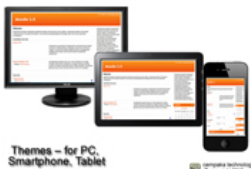
Themes - for PC, Smartphone, Tablet

ELearning is ready for Mobile. Themes for mobile is ready!