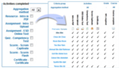
Set Completion Tracking to a Course

You can set completion criteria for a course. For example, the learner must complete the following activities in order to complete the course.