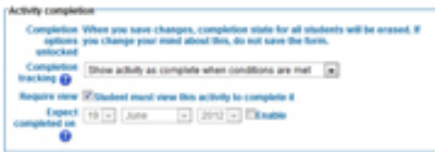
Activity Completion - Set Complete Flag to Activity