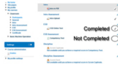
Activity Completion Tracking