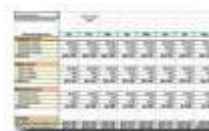
Streamlined Expenses Estimates

Pusat Latihan Komputer Cempaka ~ Your HRDC Premiere Training Provider ~