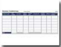
Business Debt Tracker